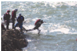
Take a leap and surface complaints.

The requirement is to document the ways that consumers travel through the organisation whilst obtaining value based on their travels, not on what management think is important. We need to conduct structured interviews with customers to establish a qualitative view of what the journeys are. The big mistake is to pre judge and to “lead the witness” by presenting a set of journeys that are perceived as being normal for comment in a survey. The survey must be designed to capture and build up a view from scratch and to evidence where the journeys arose from who and how. It is best to do some limited work in a qualitative study using open questioning techniques to help create a more in depth quantitative survey to gain some depth of data. As a customer there is nothing worse than being asked to help in a survey and then to be presented with a set of questions and answers that do not allow you to express your experience or view, because the survey builder has decided already what is important. This in my experience just happens too many times.